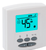
GFX3 (GFI #7050) Automatic Humidistat Included With Models 5801 & 5951