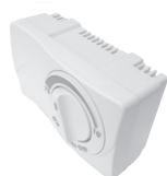
MHX3C (GFI #7038) Manual Humidistat Included With Models 5800 & 5950