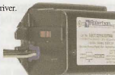
( Figure A )